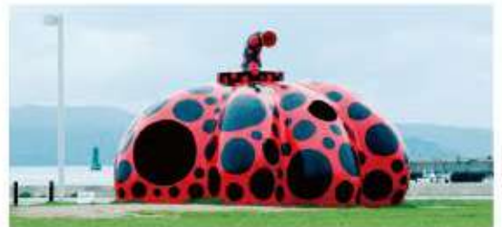
"Red Pumpkin" ©Yayoi Kusama, 2006 Naoshima Miyanoura Port Square