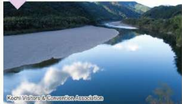
Kochi Visitors & Convention Association