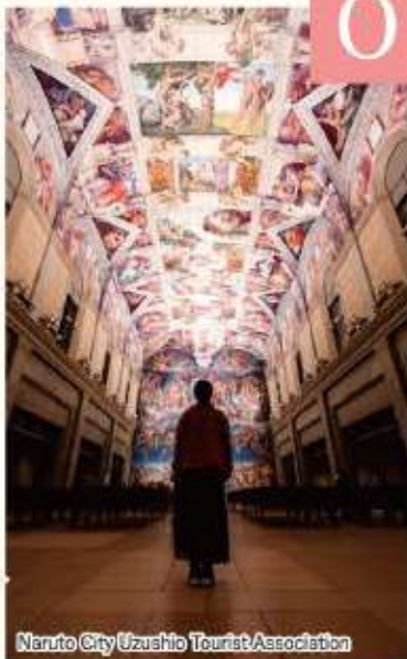
Naruto City Uzushio Tourist Association