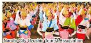
Naruto City Uzushio Tourist Association

Features 300,000 square meters of space dedicated to permanent exhibits and an approximately 4 kilometer-long viewing route. The largest in Japan and one of the few ceramic tile art museums in the world. Over 1,000 Western masterpieces from antiquity to the present day have been faithfully reproduced in full size on ceramic plates from works owned by 190 art museums in 26 countries. This is a perfect place for art education and sightseeing.